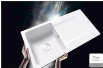
Titan Ceram - Der Werkstoff der Zukunft! Die Eigenschaften hochwertiger Keramik mit außergewöhnlicher Festigkeit vereint. Titan Ceram ermöglicht kreislaufende fliegende Formen.