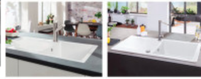
Abbildung: Siluet 50 in Weiß (links) Dieses Schüsselbild ist beispielhaft. Alle Illustrationen stellen nur die Seite der Artikelbeschreibung.